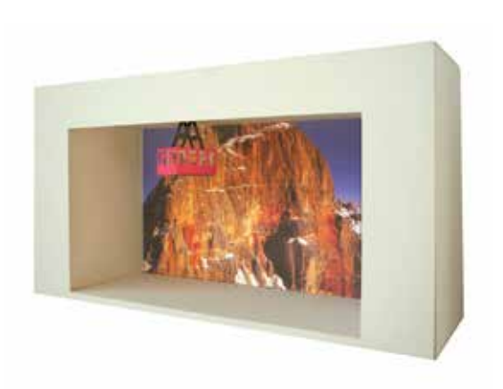
left: Zi. 274, 2007 carton, paper, color (sculpture) 34 x 61 x 18 cm

Wb,tt (weisse berge, tote täler ) 2, 2010 Scarf paneels, varnish, metal hinges (installation) 200 x 450 x 2,5 cm