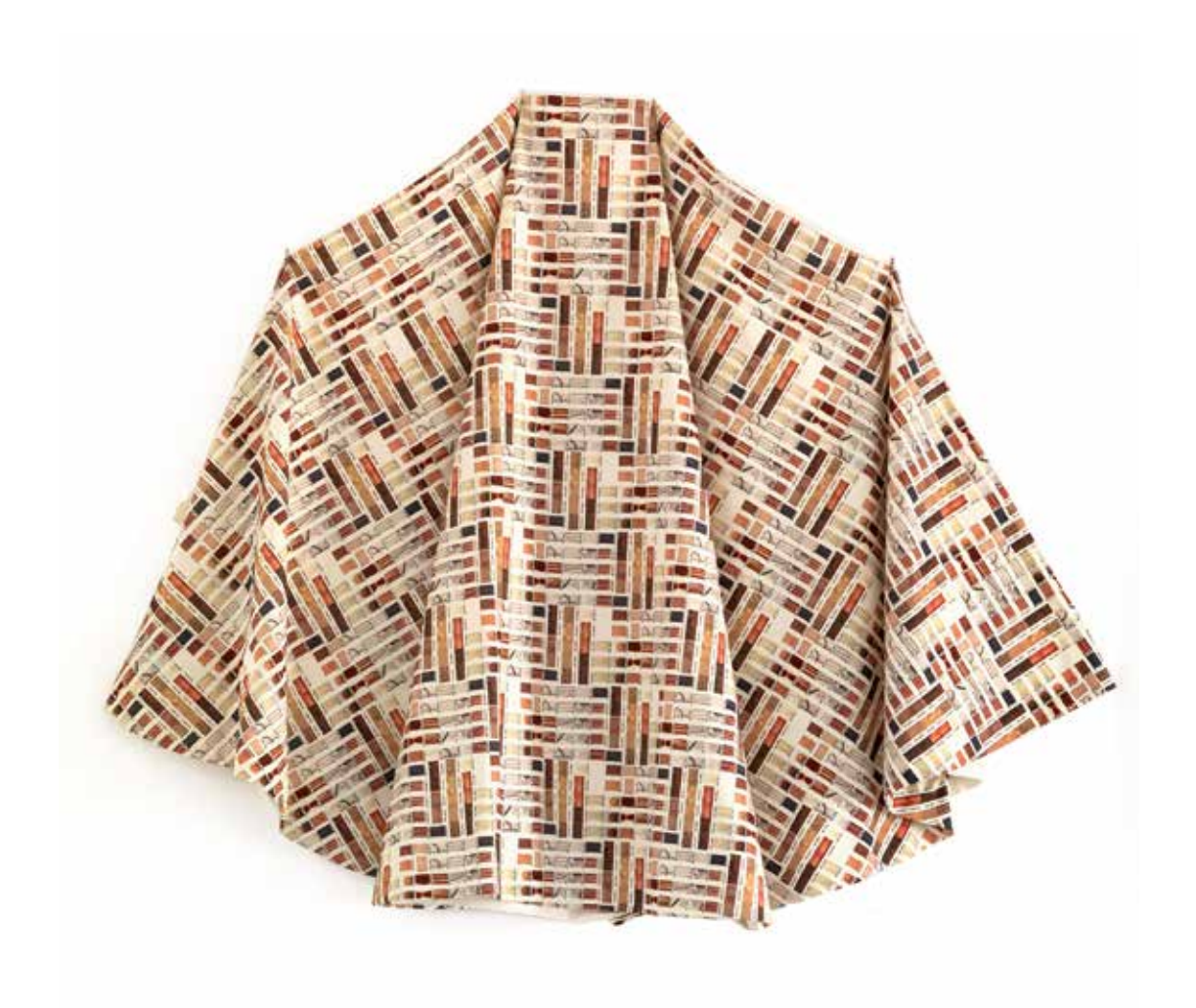
from the series Casula, Nr.1, 2012 textile object with printed cloth (half panama) 140 x 150 cm

Käthe Hager von Strobele scales the sober confines of an estate. Finding and evoking rifts within these surroundings, her installations penetrate the constitution of this living space and isolate the relics of a totalitarian and likewise melancholy accusation against the disorder of the world. Based on this ensemble of images, interiors, and textures, Hager von Strobele brings about new order by combining photographs and textural structures in mimetic processes of approximation and juxtaposition in the exhibition space.