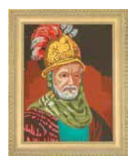
from the series Ghost in the Shell, 2012 pigment print in glasbox 62 x 50 x 10 cm

Käthe Hager von Strobele scales the sober confines of an estate. Finding and evoking rifts within these surroundings, her installations penetrate the constitution of this living space and isolate the relics of a totalitarian and likewise melancholy accusation against the disorder of the world. Based on this ensemble of images, interiors, and textures, Hager von Strobele brings about new order by combining photographs and textural structures in mimetic processes of approximation and juxtaposition in the exhibition space.