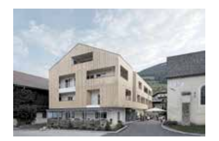
Hotel Gasthof Tanzer,

The hotel's extension is a mix between tradition and innovation; the intervention maintained the basic shape of the building, which was increased by one floor.