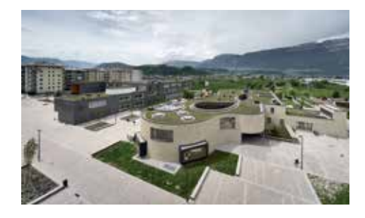
Firmian School Complex, Bozen 2015

The project is the winning entry of a competition, issued by the city of Bolzano, for two new school buildings and a public square. The location is the heart of the new neighborhood planned on the outskirts of the city. The curvilinear, introverted building of the preschool, kindergarten, and family center was the first of the two schools to be completed in 2012. The linear volume of the elementary school and community library was completed in 2014. The school complex is conceived as the new civic center for the new district with facilities open to the community after school hours, creating a hub of activity and social-cultural exchange.