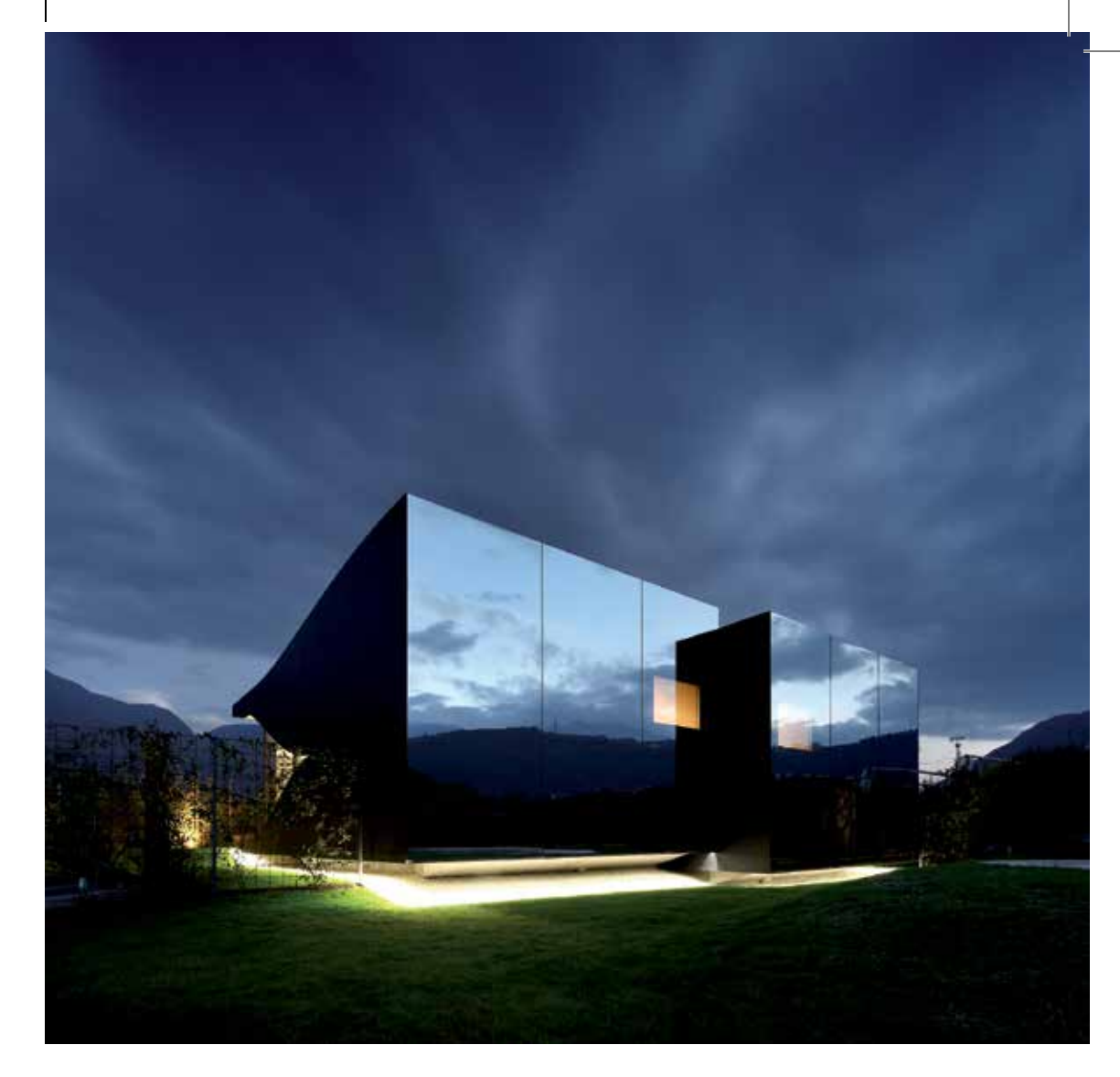
Mirror Houses, Bozen, 2014

Both units are floating on a base above the ground, offering better views to the surrounding landscape. The volume opens towards east with a big glass façade that fades with curvilinear lines into the black aluminum shell, while the west façade presents a mirrored glass that protects the units from the garden and reflects the surrounding panorama, making the units almost invisible. The old existing farmhouse is mirrored in the new contemporary architecture and literally blends into it rather than competing against it.