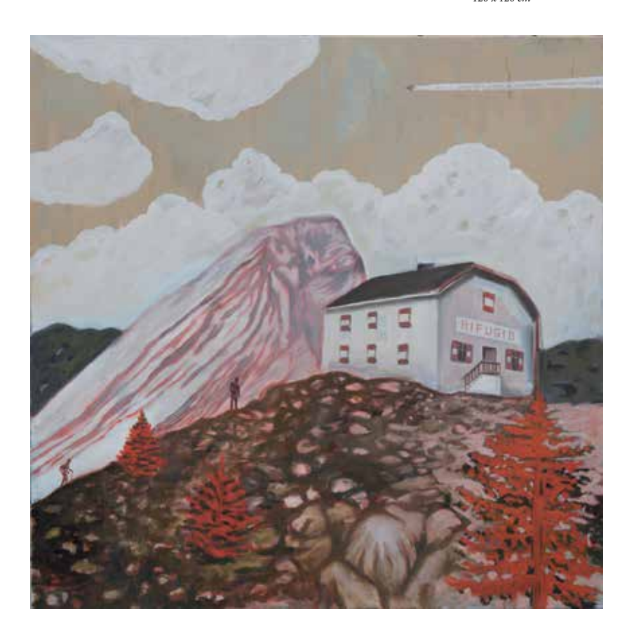
Rifugio, 2015 oil and acryl on canvas 120 x 120 cm

It is the symbol of a desire for a peaceful and serene world. The proximity of beauty and destruction appears underneath a thin and fragile aesthetics. The hidden threat doesn't influence my drawings. My permanent political and social examination insinuate itself in the paintings without my intention.