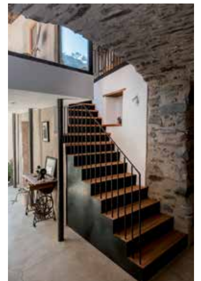
Ruckenzaunergut, Latsch, 2015